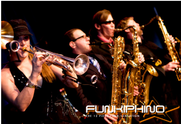
Funkiphino's Five-Piece Horn Section