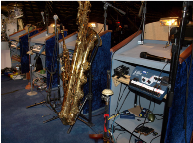
The view from the horn section for the Tonight Show