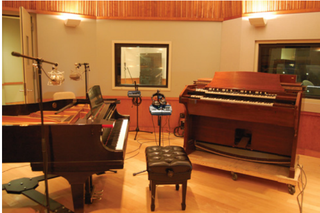
Personal Mixers with the keyboards in the tracking room