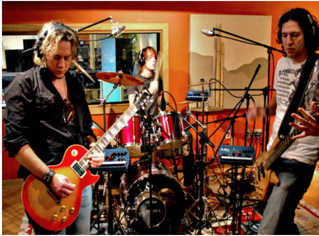
Tracking live in the Bamboo Room studio