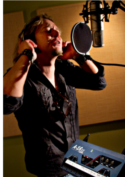
Recording vocals in the iso booth

The studio features vintage instruments and recording equipment. Among this gear are vintage Pultec EQs, Urei 1176 limiters, a Lexicon 480L, and AMS RMX and DMX 15-80 units. Other equipment in the studio includes Pro Tools HD3 Accel powered by an Apple G5 and a collection of SSL 4000 plugins. Bamboo Room Studio also features Neumann, AKG, Rhode, Sennheiser and Shure mics, as well as preamps from Chandler, Focusrite and Vintech.