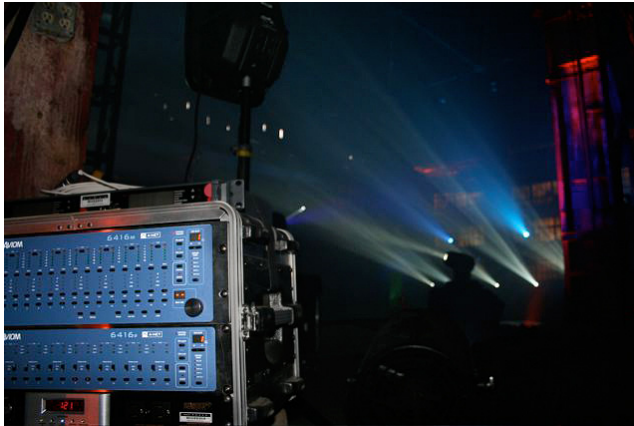
Aviom gear on the set of The Magic Secrets Revealed