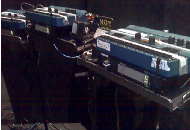
Personal Mixers on the platform at Seacoast Grace